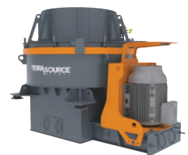
Tritura Vertica-Shaft Impactor™