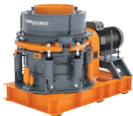
Saxum Fixed-Shaft Cone Crusher™

TerraSource Global has a full range of turn-key solutions for all your crushing and feeding operations.