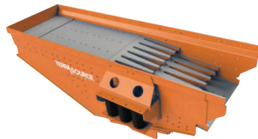
TSG-GF Series Grizzly Feeder